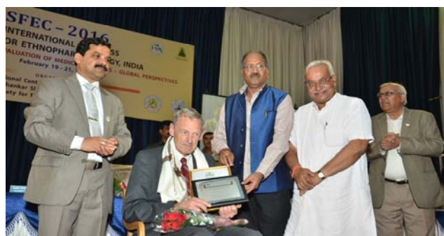
SFE Annual Award ceremony during SFEC