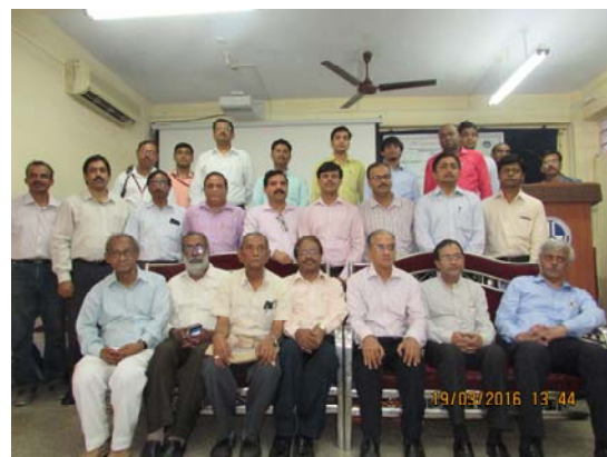
Dignitaries and Resource Person of National Seminar