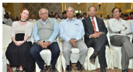
Dignitaries and Resource Person of SFEC 2016