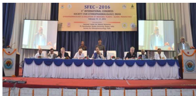
Inaugural Programme of SFEC-2016

The society has already made its presence throughout India, providing networking for dissemination of knowledge for the promotion of Ethnopharmacology and Medicinal Plant through different local chapters in different parts of India with its vision on “Globalization of local knowledge and localization of global technology”. The 3rd International Congress SFEC 2016 of the SFE-INDIA was held at Pandit Ravishankar Shukla University, Raipur, Chhattisgarh, India during February 19-21, 2016 with the theme of “ Ethnopharmacology and Evaluation of Medicinal Plants- Global perspective ”.