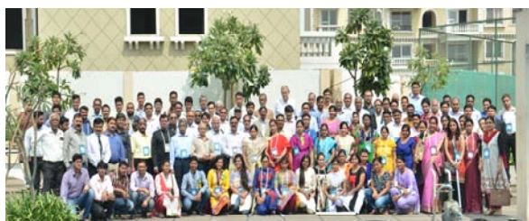
Participants and dignitaries of SFEC 2016