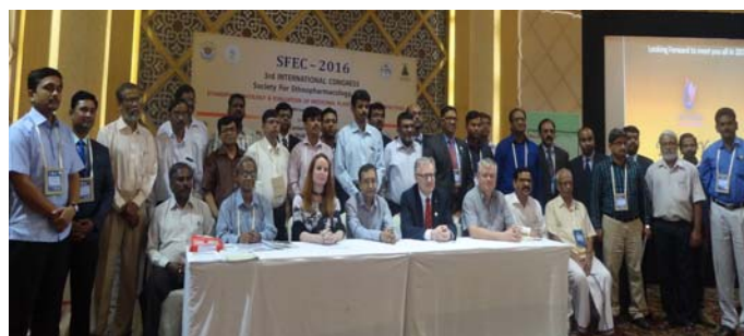
SFE Executive committee meeting during SFEC 2016