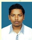
Mr. Amit Kar Associates