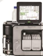
Reveleris® Prep Flash chromatography and Prep HPLC