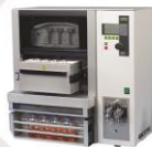
SpeedExtractor E-914/E-916 Pressurised solvent extraction