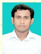
Mr. Bhaskar Das Associates