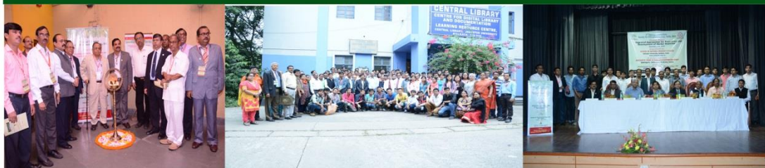
3 rd International Congress of Society for Ethnopharmacology, India (SFEC 2016) during February 19-21, 2016 at Pt. Ravishankar university, Raipur, Chhattisgarh, India