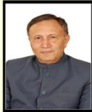
Shri Shekhar Dutt Former - Governor Chhattisgarh, India